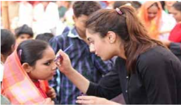
An intern of Akhuwat painting a girl's face at the carnival