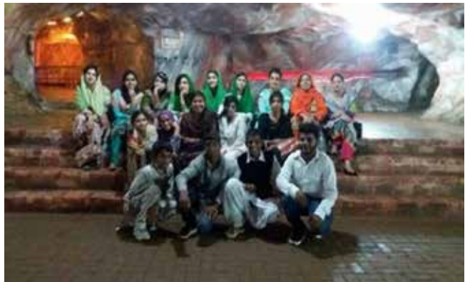
Students and teachers of GERS at the Khewra Salt Mines

and learn many new things from their experiences. On 12th, August, 2017 teachers and Class 8 students were taken to a trip to Khewra Salt Mines and Kallar Kahar. Students of Class 5 visited the Harappa Museum at Jan-a-Jahanara, and also Bhawa Singh (for landscaping and gardening). Similarly, special friends of Roshni also had an excursion. They visited Rana Resort and enjoyed the beautiful scenes of over 200 acres of thick bamboo jungle.