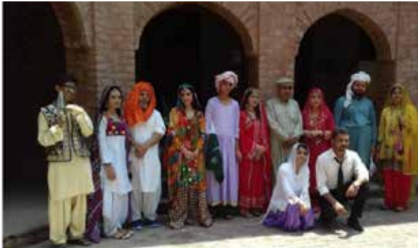
Roshni Friends in different costumes after their performance in a drama