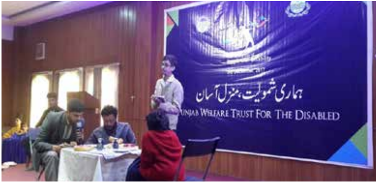
Roshni Special Friends performing a tableau, on the International Day of Persons with Disabilities, in the Rising Sun Institute, Lahore

The International Day of Persons with Disabilities was celebrated at the Rising Sun Institute of special children on 3rd December, 2017, with the collaboration of the Punjab Welfare Trust for the Disabled in Lahore and some institutes for special persons. The observance of this day aims to promote an understanding of disability issues and mobilise support for the dignity, rights and well-being of persons with disabilities. Many special persons' organisations took part in the event. Roshni Friends also participated in the event and performed a tableau on the theme of "Ehsaas" (Realisation).