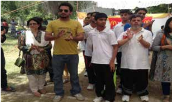
Roshni Friends during SOP Games at Punjab Stadium, Lahore