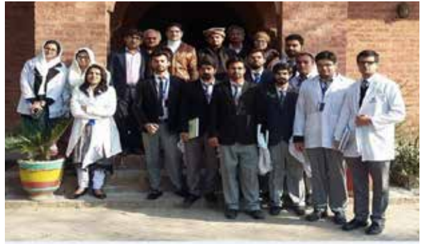
Avicenna Medical College Students during their visit to Roshni