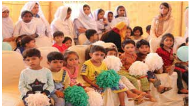
Kindergarten students during the foundation stone-laying ceremony