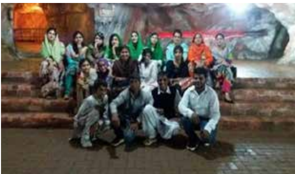
Students and teachers of GERS at the Khewra Salt Mines