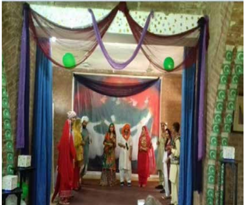
Roshni Friends & GERS teachers performing a tableau