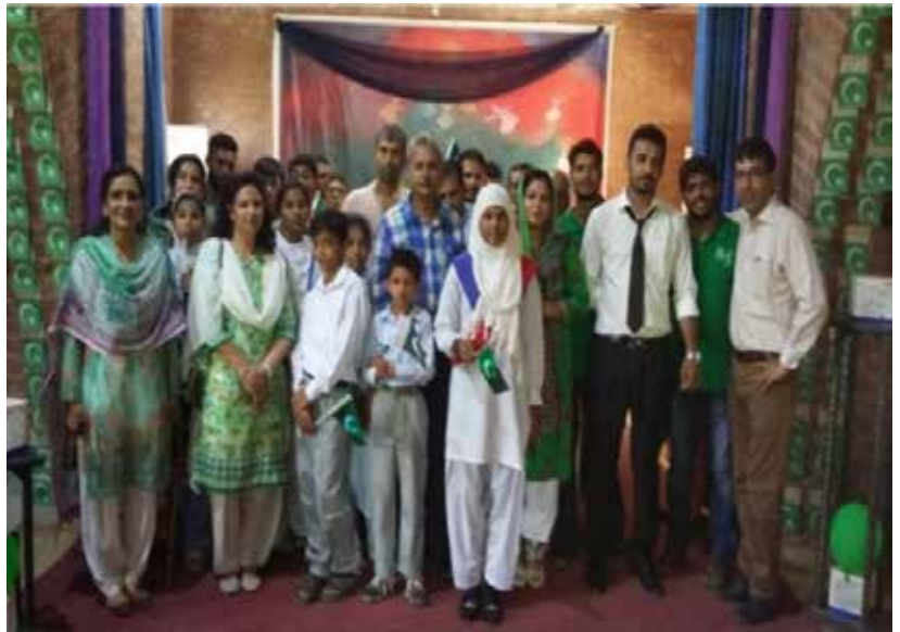
Group photo of Roshni staff with students of GERS on Pakistan's Independence Day celebrations in Roshni

Independence Day of Pakistan was celebrated enthusiastically by the students of GERS and special friends in Roshni Association. They dressed in the colours of the national flag, with the crescent and stars painted on their faces. The students enthusiastically sang the National Anthem and several patriotic songs renewing the hope, promise and high aspirations for the future of Pakistan. They delivered inspiring speeches and performed in different tableaux on the auspicious day.