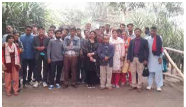
Roshni Staff & Special persons' visit to Rana Resort, Lahore