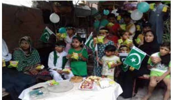
CBR special Children while celebrating Independence Day