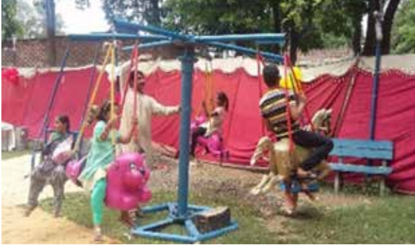
Students enjoying merry-go-round rides at the carnival