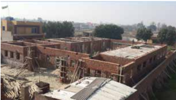
A view of Green Earth Roshni School's under construction new building