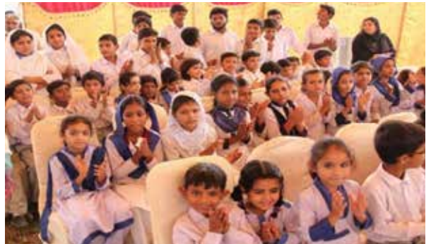
Students of GERS during the foundation stone-laying ceremony of their new building