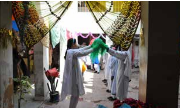
Welcoming ceremonies of Class 1 & Kindergarten at GERS