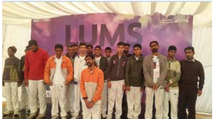
Group photo of Roshni Friends with staff at LUMS