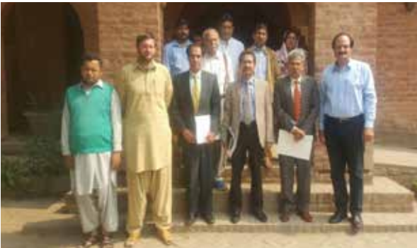
Secretary Special Education during his visit to Roshni