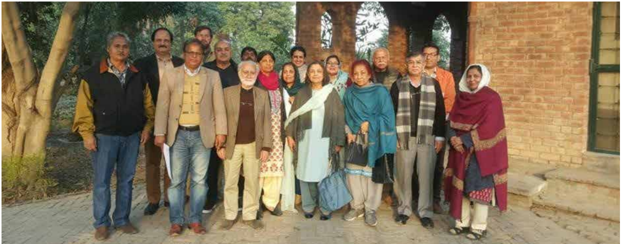
Group photo of newly elected members of Steering Committee with Roshni Staff