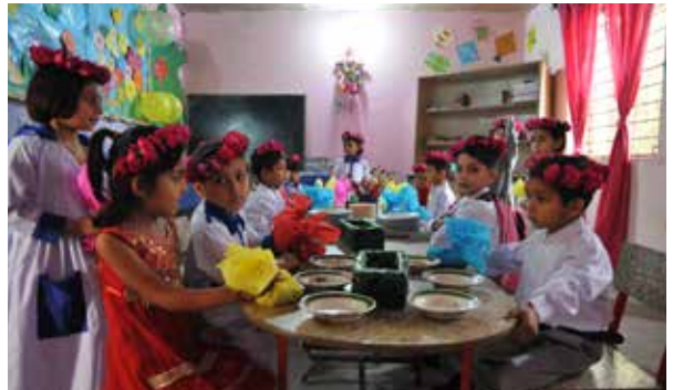
Students of K.G and class 1 on their welcome Day at School