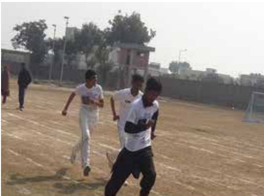
Roshni Friends during the 100 metres race at LUMS