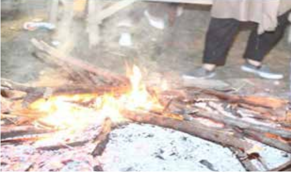
Burning of woods on Bonfire at Roshni