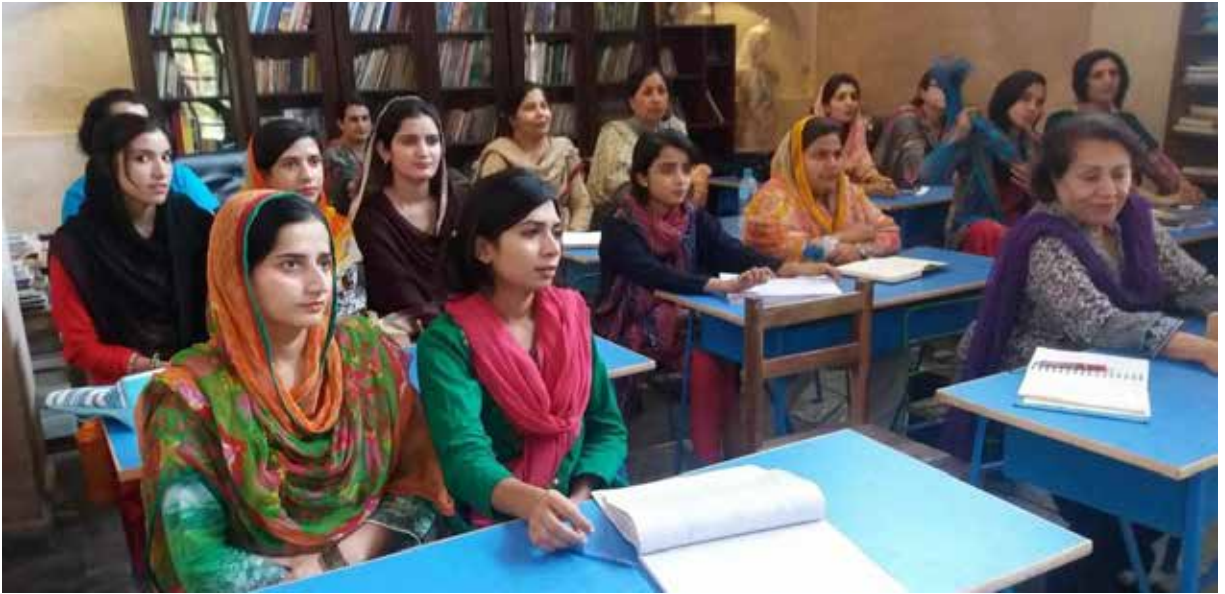
Participants at the Teachers' Training Session