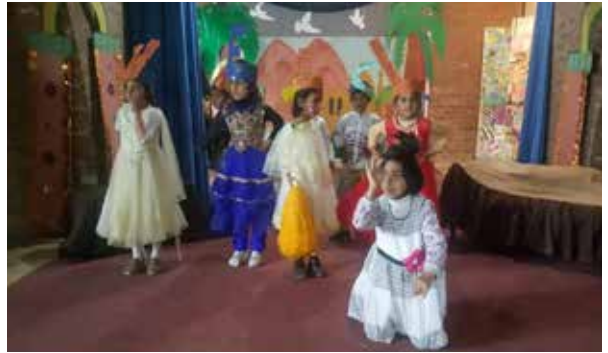
Students of GERS performing a tableau on Annual Drama