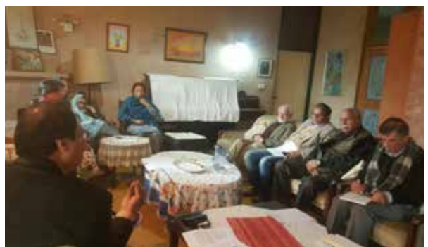
The General Body Meeting of Committee Members at Roshni