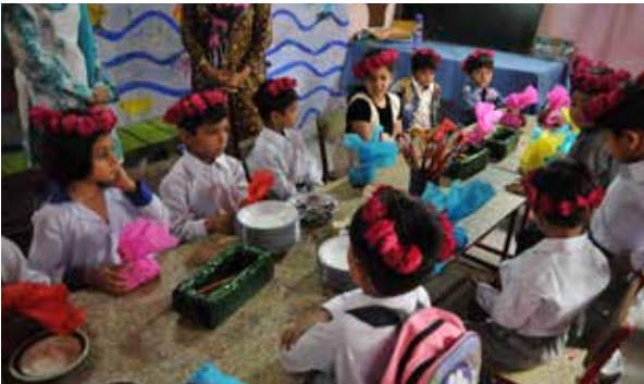
Students of GERS during the refreshment time at School