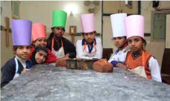
GERS students during their visit to Roshni Organic Bakery