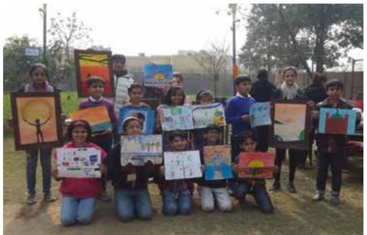
Students from PSRD painting with their feet. On the right a group displays paintings during the painting competition